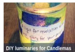
DIY luminaries for Candlemas

To celebrate this feast, consider purchasing (or even making!) special candles to keep and use in your home. If possible, bring these candles to your parish's Candlemas celebration so that they can be blessed during Mass. If this isn't possible, ask your priest to bless your candles at an alternate time. Then, throughout the year, light your blessed candles during dinner on special occasions (Sundays, feast days of favorite/patron saints, birthdays or anniversaries of baptisms, weddings or other sacraments), during times of prayer (especially if you pray at night alone or with your family) or during times of vigil (perhaps awaiting the birth of a child, caring for a sick family member or mourning the loss of a loved one). The glow of a flickering flame may help rekindle your love for God in times of difficulty, or it may be a reflection of your joy. Regardless, it will serve as a sign of the One who is God's light to the nations, God's salvation to all people.